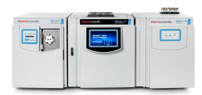
Example of TriPlus 500 HS autosampler 12-vial configuration directly connected to the Thermo Scientific™ ISQ™ 7610 GC-MS