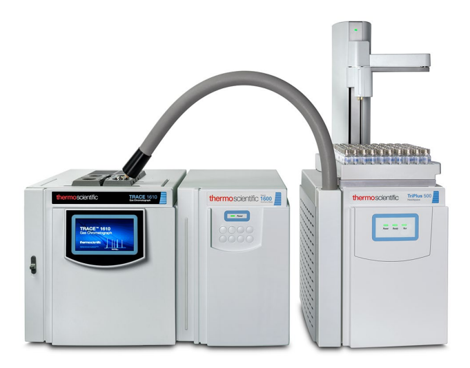
Example of TriPlus 500 HS autosampler 120-vial configuration connected through the transfer line to the TRACE 1610 GC with Auxiliary Oven